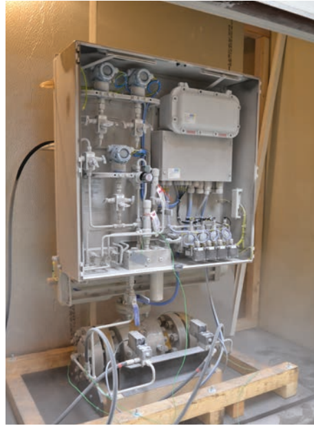
The system has to withstand extreme temperatures and was tested in a cold chamber