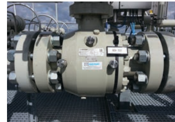
The A-rated custom built valves guarantee zero leakage

Hartmann Valves has a global reputation for delivering high quality ball valves and wellheads for the energy industry. Our customers demand the highest standards in operational performance, reliability and endurance – even in the most challenging environments.