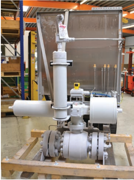
The Hartmann valve ready for testing to meet Nord Stream's demanding temperature, pressure and safety standards

With Fahlke Control Systems already operating effectively on other sections of the pipeline, Nord Stream's engineering partners CONSUB and GASCADE recommended Fahlke as project lead for the upgrade, and Hartmann Valves was selected as an ideal partner to supply the high performance valves.